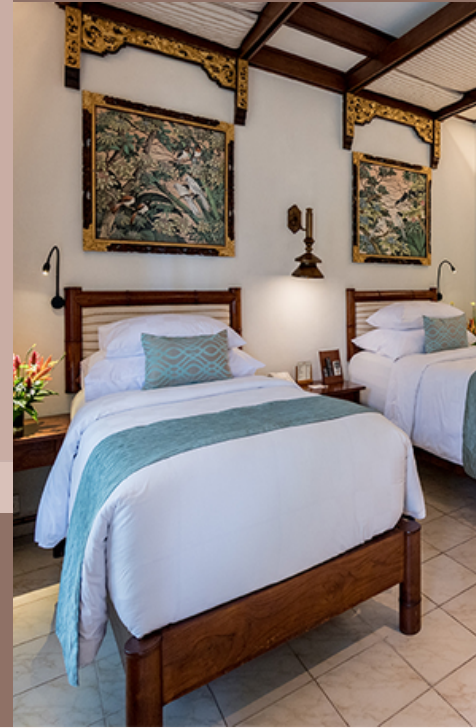
Delux Cottage Garden